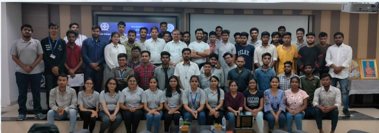
CSVТУ'S IEEE STUDENT BRANCH ORGANIZES ENGAGING WORKSHOP TO EMPOWER ASPIRING GAME DESIGNERS AND ANIMATORS